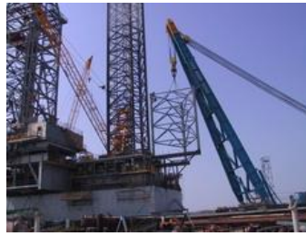
Setting Leg Sections

MAIN GENERATOR 300Kw STANDBY GENERATOR 30Kw AIR COMPRESSOR 375 CFM BALLAST PUMPS 2 x 4" DECK WINCHES 4 AIR TUGGERS 2 x 10,000 Lb 2 x 8,000 Lb 2 x 4,000 Lb