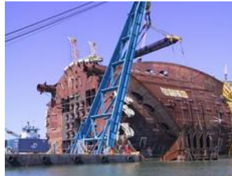
Lifting 550 Ton Cradles From 90' Of Water